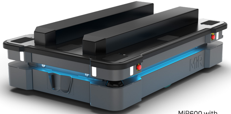
MiR600 with EU Pallet Lift 600

With increased ability to withstand dust particles and fluids, the MiR600 & MiR1350 are industrial, safer, and more reliable than any other AMRs, and they can be used in more environments.