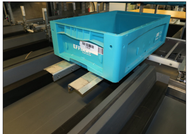
The extractor presents up to five different boxes in each working cycle