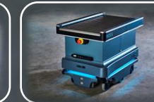
TR125 Auto 250