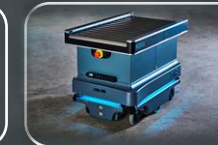
TR125 Manual 250